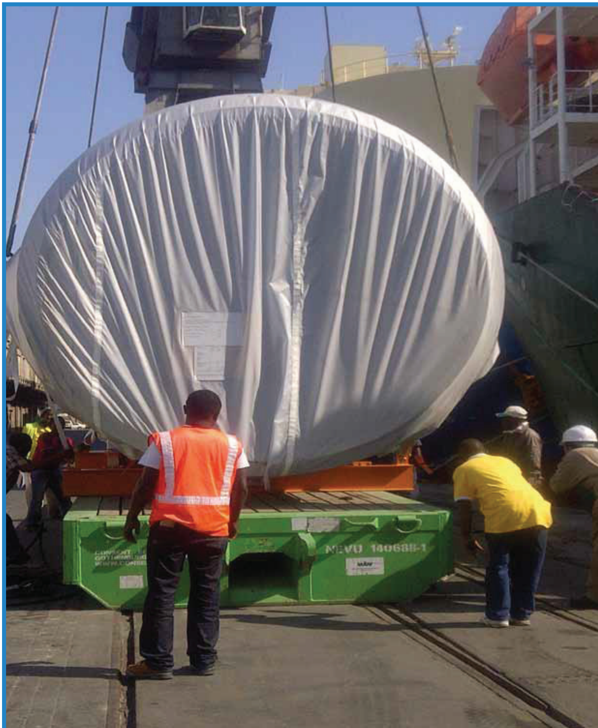
KAS FREIGHT LTD professional members of staff at work during off-loading of project cargo at the port of Dar es Salaam.