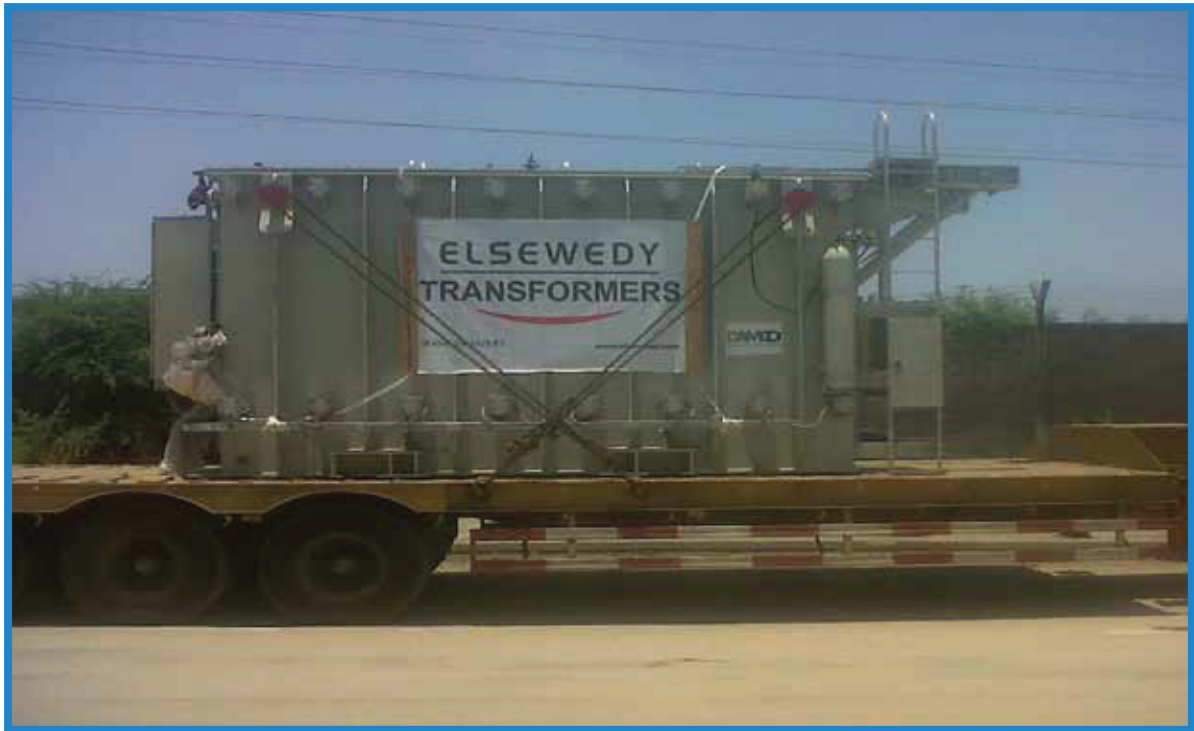
DAMCO (T) LTD CARGO (TRANSFORMERS) FOR ZESCO – ZAMBIA