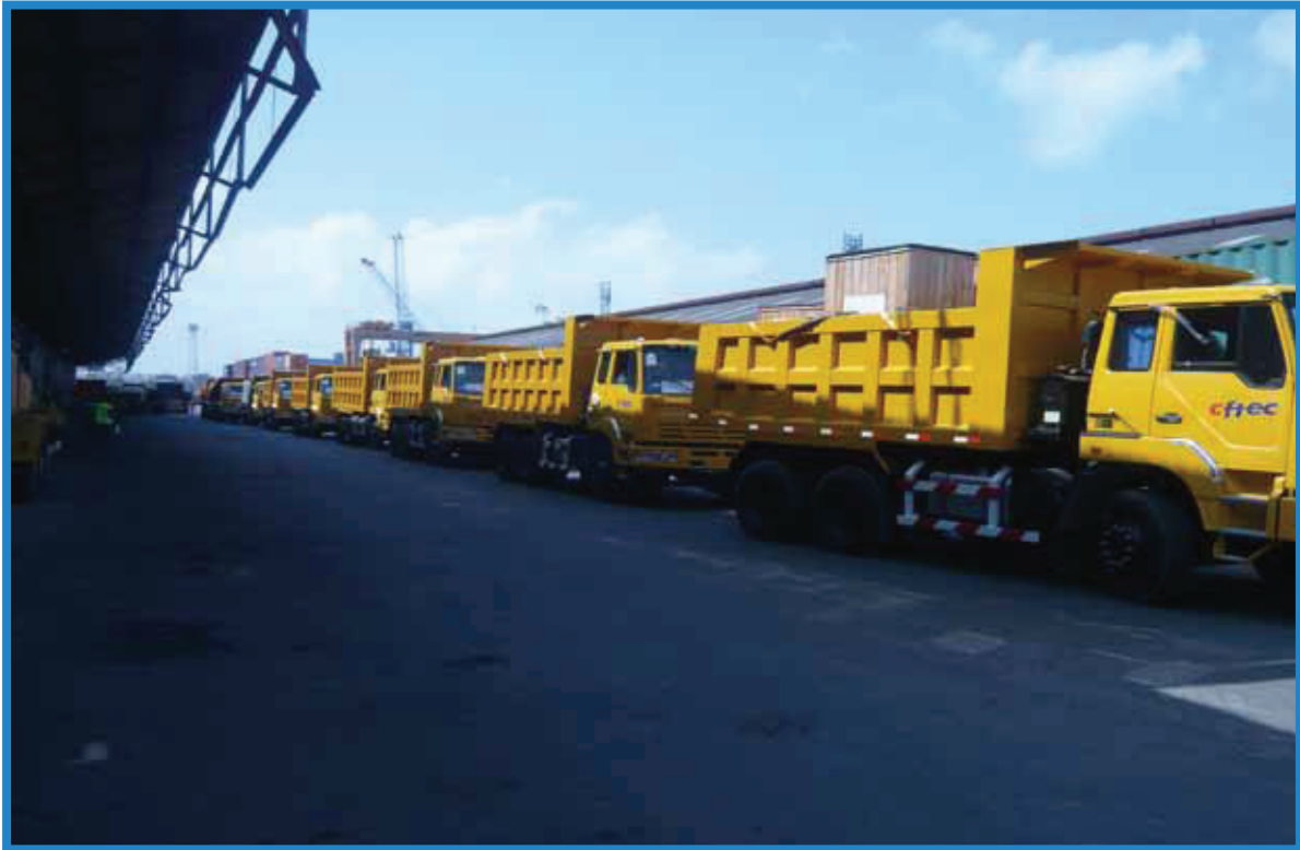
Some of the many units cleared and transported by KAS FREIGHT LTD at the Port.