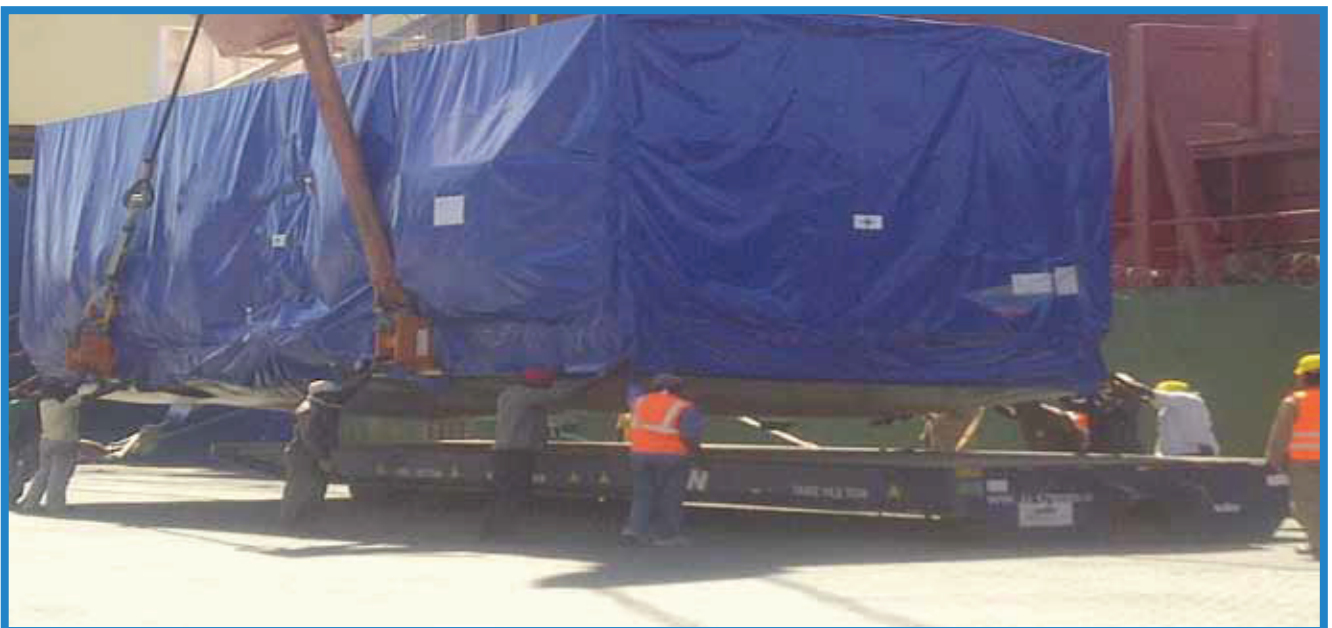
Part of a large project consignment cleared and handled by KAS FREIGHT LTD at port of Dar es Salaam.