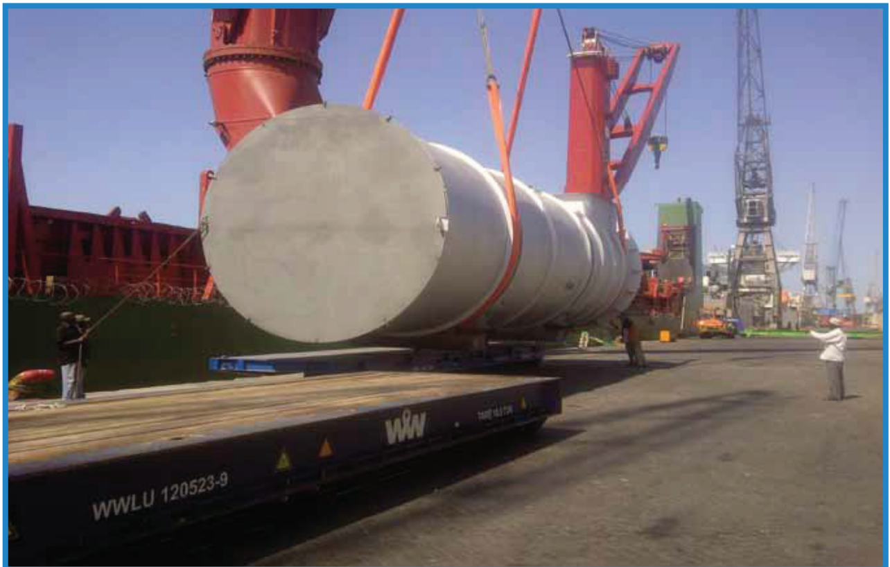
TANESCO project cargo being off loaded at Dar es Salaam port under our professional supervision.