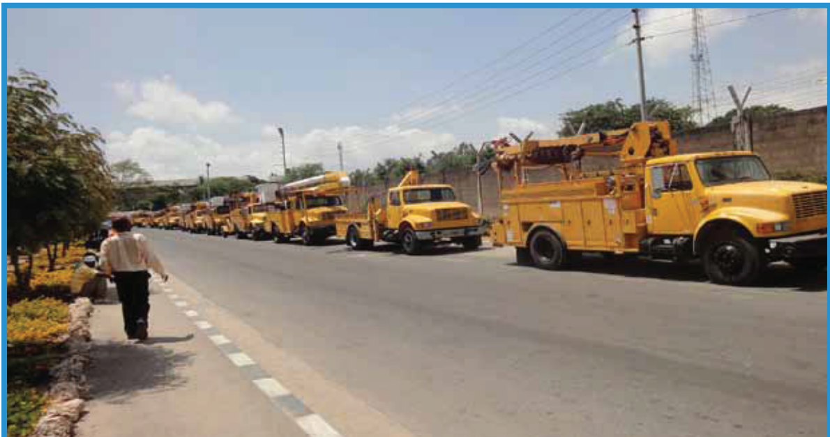
Units out of the port ready for delivery to the clients' premises. Self-driven by our own well-trained, professional and disciplined drivers.