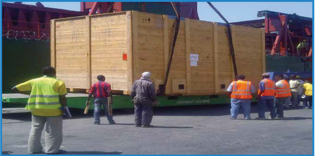
Rwanda power project cargo being off-loaded at Dar es Salaam port under our professional supervision and handling.